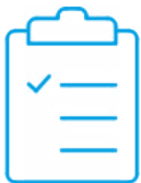
Factory calibration certificate