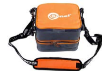
M-8 carrying case WAFUTM8