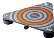
PRS-1 resistance test probe WASONPRS1