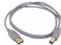
USB cable WAPRZUSB