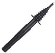
test probe with banana socket; 5 kV; black WASONBLOGB2