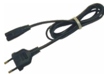
230 V power cord (IEC C7 plug) WAPRZLAD230