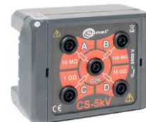
CS-5kV calibration box WAADACS5KV