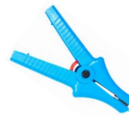
blue "crocodile" clip 11 kV 32 A WAKROBU32K09